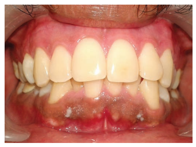
Fig. 8: One week postoperative healing

The surgical removal of undesirable pigmentation using scalpel is one of the first and still popular techniques to be employed. This particular procedure typically involves surgical removal of gingival epithelium along with a layer of the underlying connective tissue and allowing the denuded connective tissue to heal by secondary intention. The new epithelium that forms is devoid of melanin pigmentation. Care must be taken to avoid exposing the underlying bone; hence, it should be removed in thin sections. All remnants of the pigment layer have to be removed to avoid chances of recurrences. In this particular case, the scalpel method of depigmentation showed better results from both clinical and patient's point of view. The operated area healed completely within 10 days with normal appearance of gingiva. The use of scalpel technique for depigmentation is simple, effective, and most economical as compared with other techniques, which require more advanced armamentarium. The scalpel surgical technique leads to unpleasant bleeding during and after the procedure; hence, it is necessary to cover the surgical site (lamina