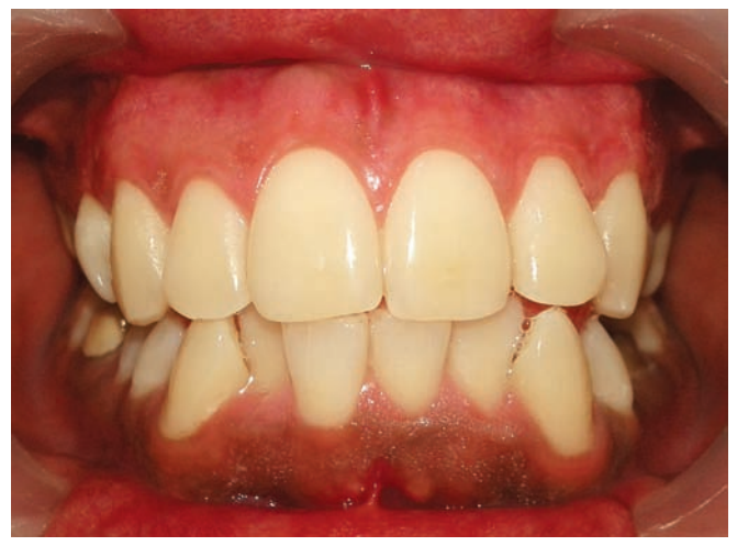
Fig. 9: Four months postoperative follow-up