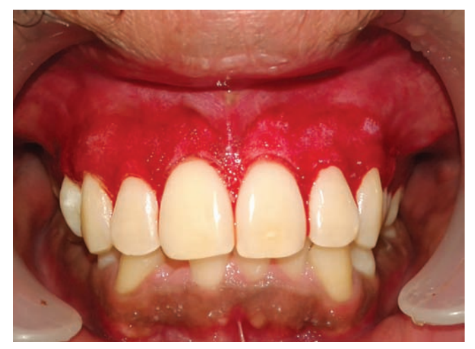
Fig. 6: Removal of pigment layer—deepithelialization

Patient's acceptance of the procedure was good. Healing process was uneventful with no postoperative pain, hemorrhage, and infection. No scarring was observed,