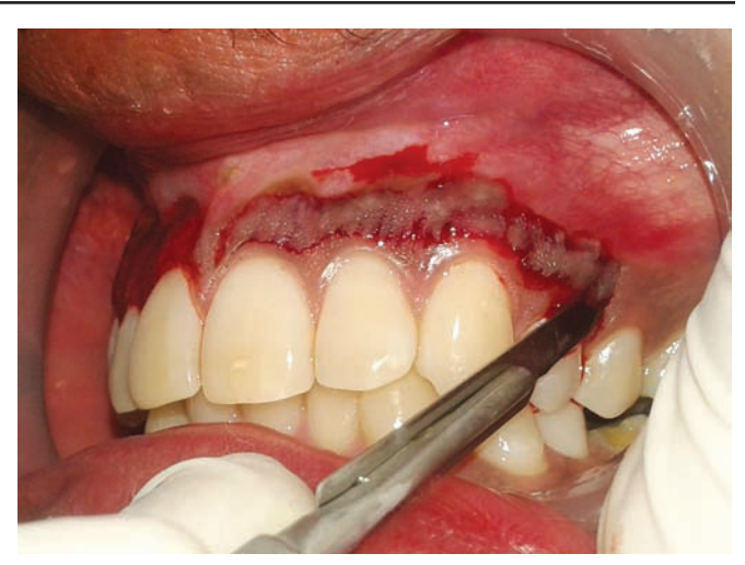
Fig. 3: Split thickness flap using scalpel