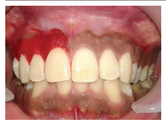
Fig. 2: Removal of pigment layer